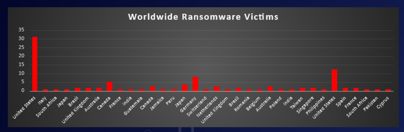
Figure 4: Ransomware Victims Worldwide

A broad spectrum of countries—including India, South Africa, Italy, Netherlands, Switzerland, Philippines, Belgium, Poland, Guatemala, Jamaica, Peru, Romania, Cyprus, and Pakistan—each experienced 0.89% of total incidents, a reminder that even lower-profile or emerging economies are not exempt from global ransomware activity.