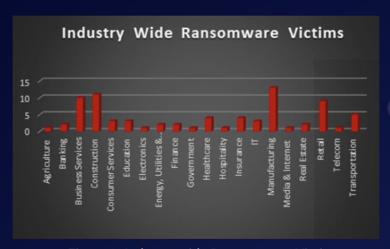
Figure 3: Industry-wide Ransomware Victims