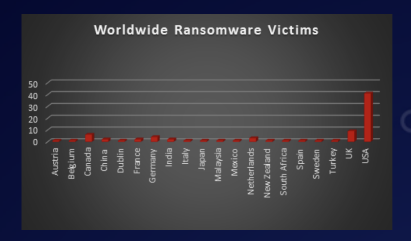
Figure 2: Ransomware Victims Worldwide